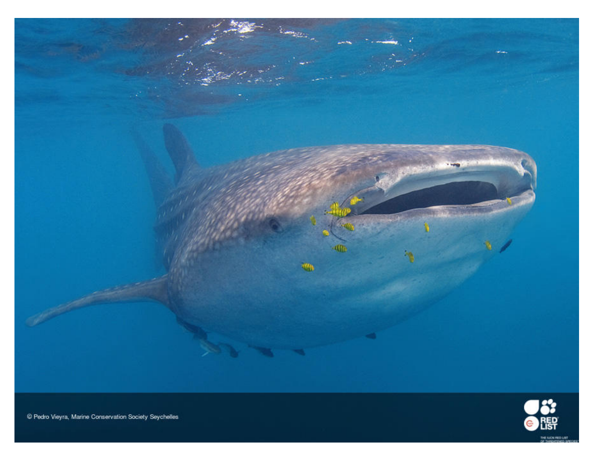
From IUCN redlist website <a href="https://www.iucnredlist.org/species/19488/2365291">https://www.iucnredlist.org/species/19488/2365291</a>

Proposal for the uplisting of the whale shark Rhincodon typus from Annex III to Annex II of the Protocol concerning Specially Protected Areas and Wildlife (SPAW Protocol)